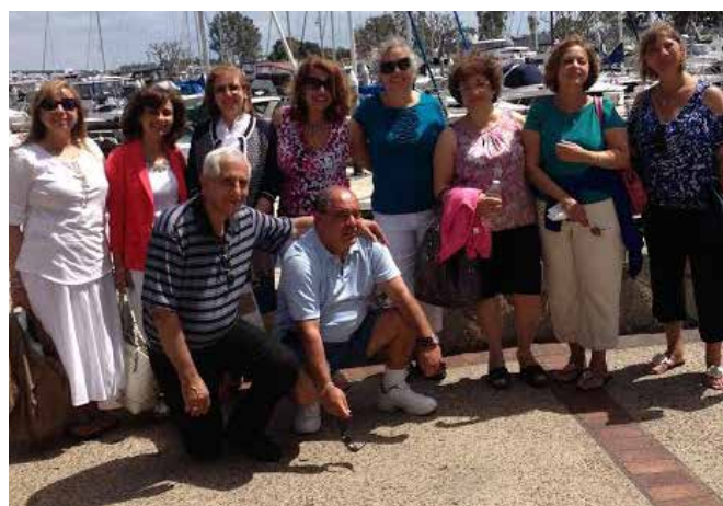
Logos TV Need Help