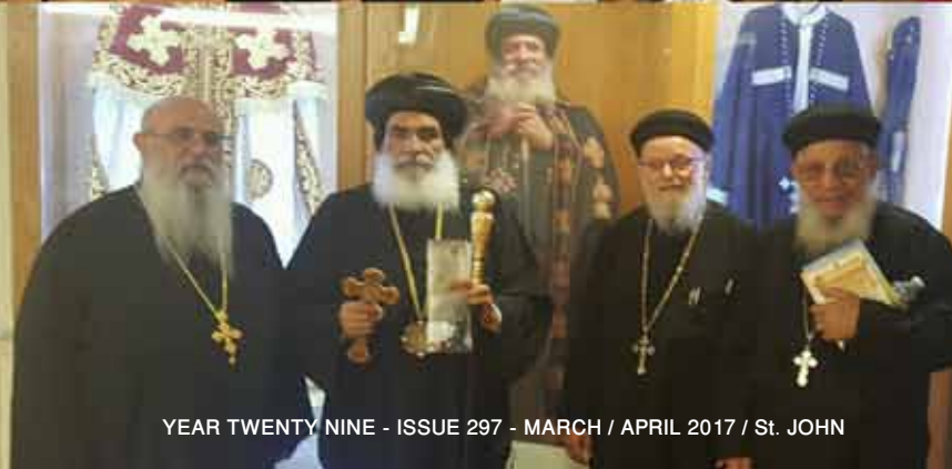
بعض الخدام يحتفلون ببلوغ القمص زكريا بطرس والقس اغسطينوس سن ٨٢